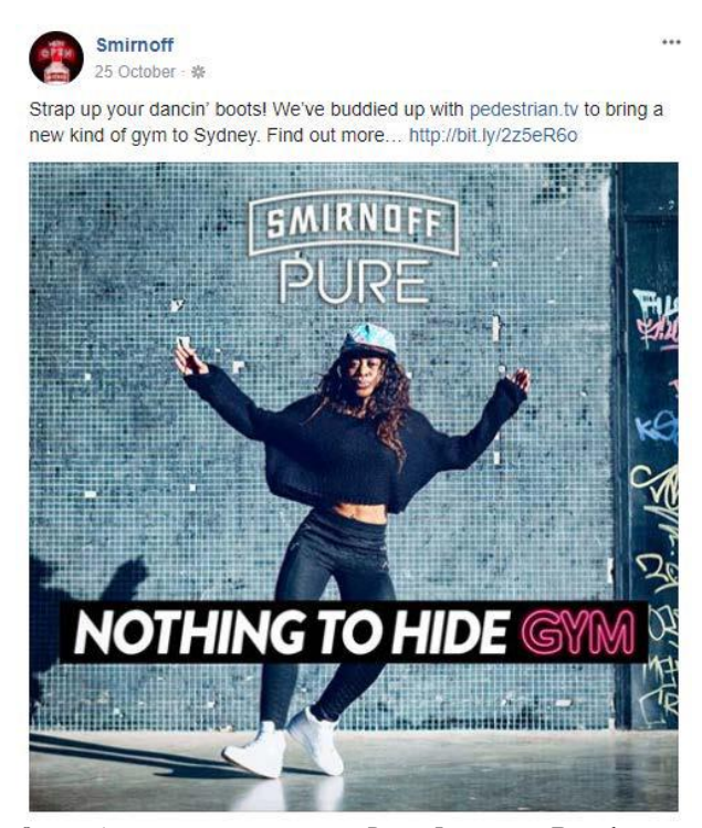
Figure 1 Example of screenshot taken from Facebook on 14 December 2017